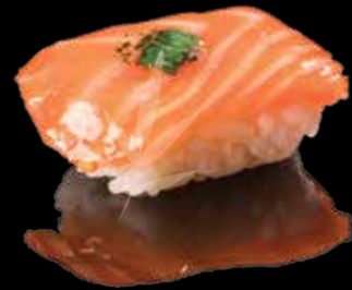
RICE CAKE SALMON 420 den