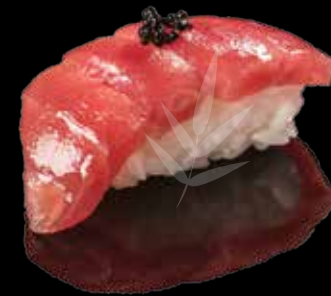
NIGIRI RICE TUNA 100 den