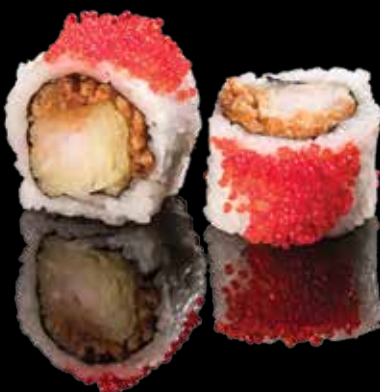
CRISPY TEMPURA SHRIMP ROLL 440 den