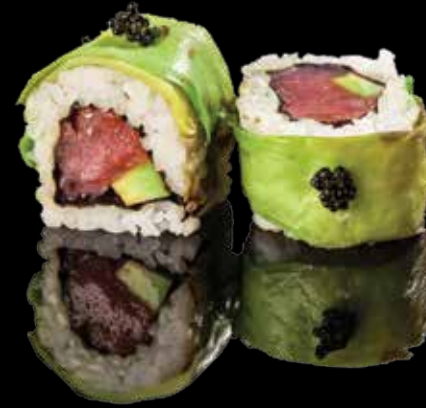
SPICY MAGURO ROLL 460 den