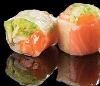
RICE PAPER ROLL 420 den