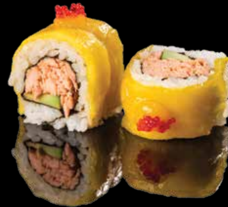
MANGO ROLL 420 den