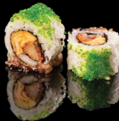
DRAGON ROLL 440 den