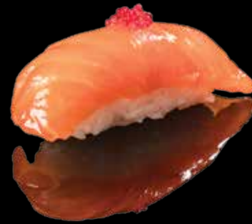
NIGIRI RICE SALMON 100 den