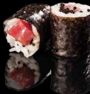
MAGURO MAKI 450 den