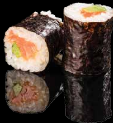
SALMON AVOCADO MAKI 420 den