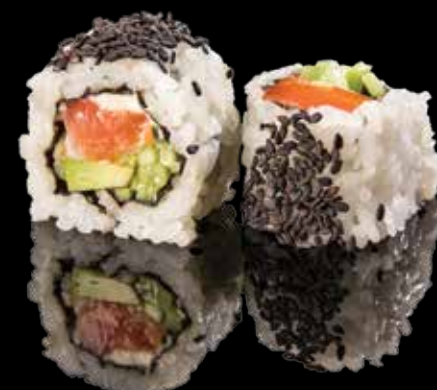
NEW YORK ROLL 440 den