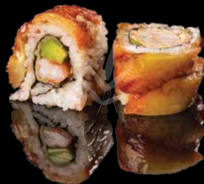
UMAGI AVOCADO ROLL 450 den