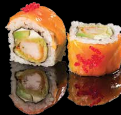
SMOKED SALMON ROLL 520 den