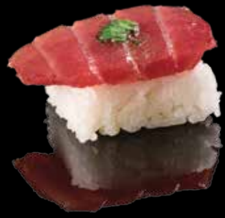
RICE CAKE TUNA 420 den