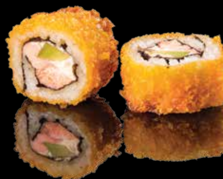
FRIED ROLL FOUR 400 den