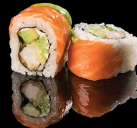
TEMPURA SHRIMP ROLL 420 den